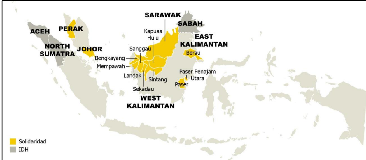
NI-SCOPS jurisdictions in Indonesia and Malaysia